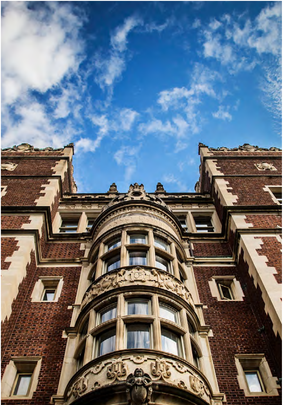
The Quadrangle